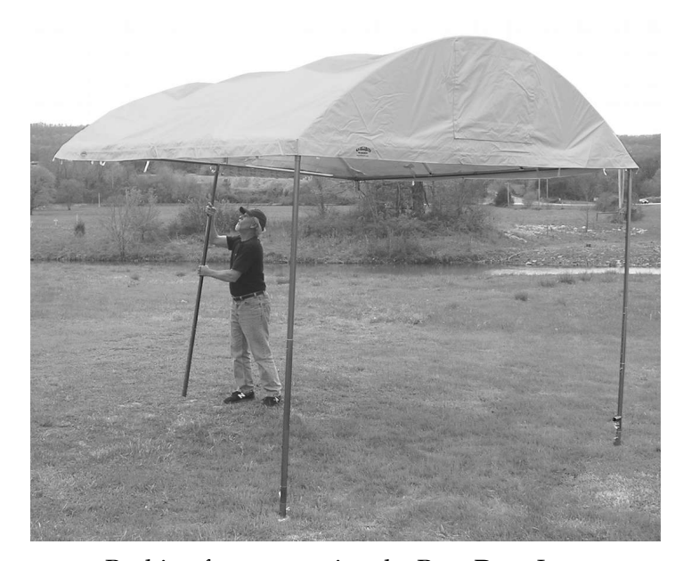
Pushing frame up using the Rear Door Leg

<u>A word of caution for windy days:</u> All canopies are vulnerable to wind gusts until they are securely tied or weighted down. Be especially careful while you have the front legs installed and the back edge of the canopy resting on the EasyRiser pole. Ask a neighbor to help hold it down while you finish installing the legs.