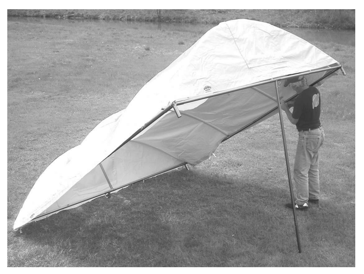
Canopy roof raised and supported on Door Leg