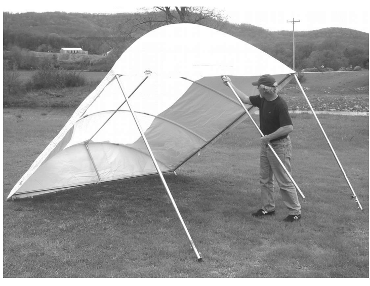
Front legs attached, removing the Door Leg