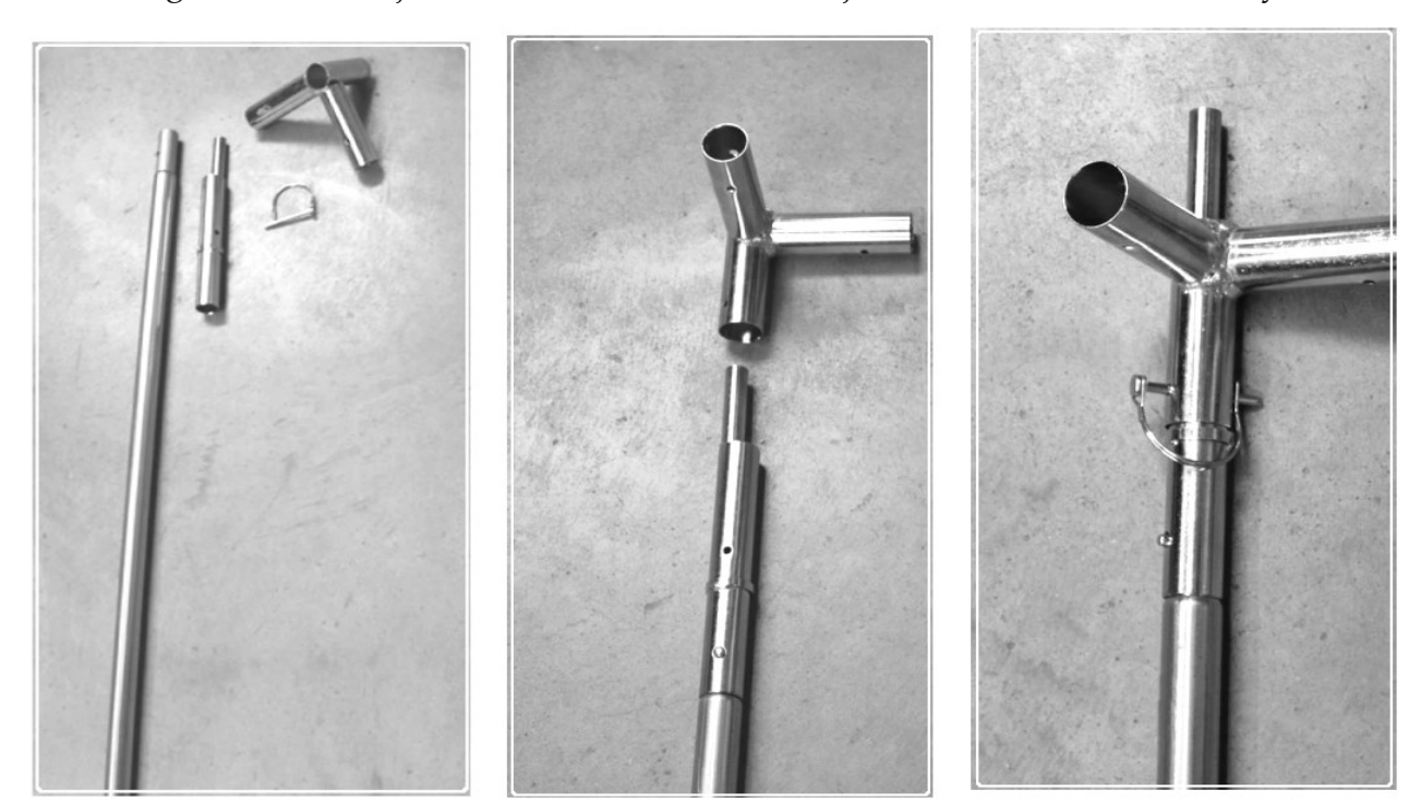
Leg parts with Corner Joint

Upper Leg Fittings snap onto top end of legs. The photo below demonstrates the attachment of the leg to the corner joint; do not attach to corner joint until roof frame is fully assembled.