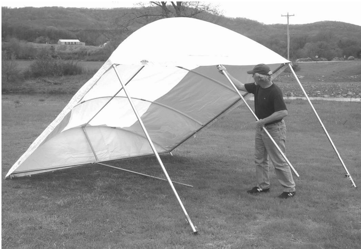
Canopy roof raised and supported on telescoping leg pole