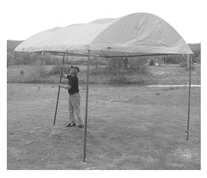
Pushing frame up using the rear EasyRiser pole

To take the canopy down: Reinstall the rear EasyRiser pole and remove rear legs first, then remove EasyRiser pole and lower frame to the ground. Repeat at the front, using a leg pole.