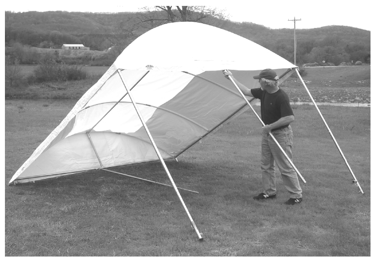
Front legs attached, removing the leg Pole