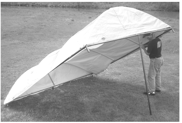
Canopy roof raised and supported on "collapsed" leg pole