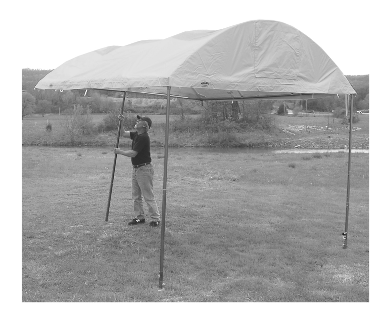
Pushing frame up using the rear EasyRiser pole

<u>A word of caution for windy days:</u> All canopies are vulnerable to wind gusts until they are securely tied or weighted down. Be especially careful while you have the front legs installed and the back edge of the canopy resting on the EasyRiser pole. Ask a neighbor to help hold it down while you finish installing the legs.