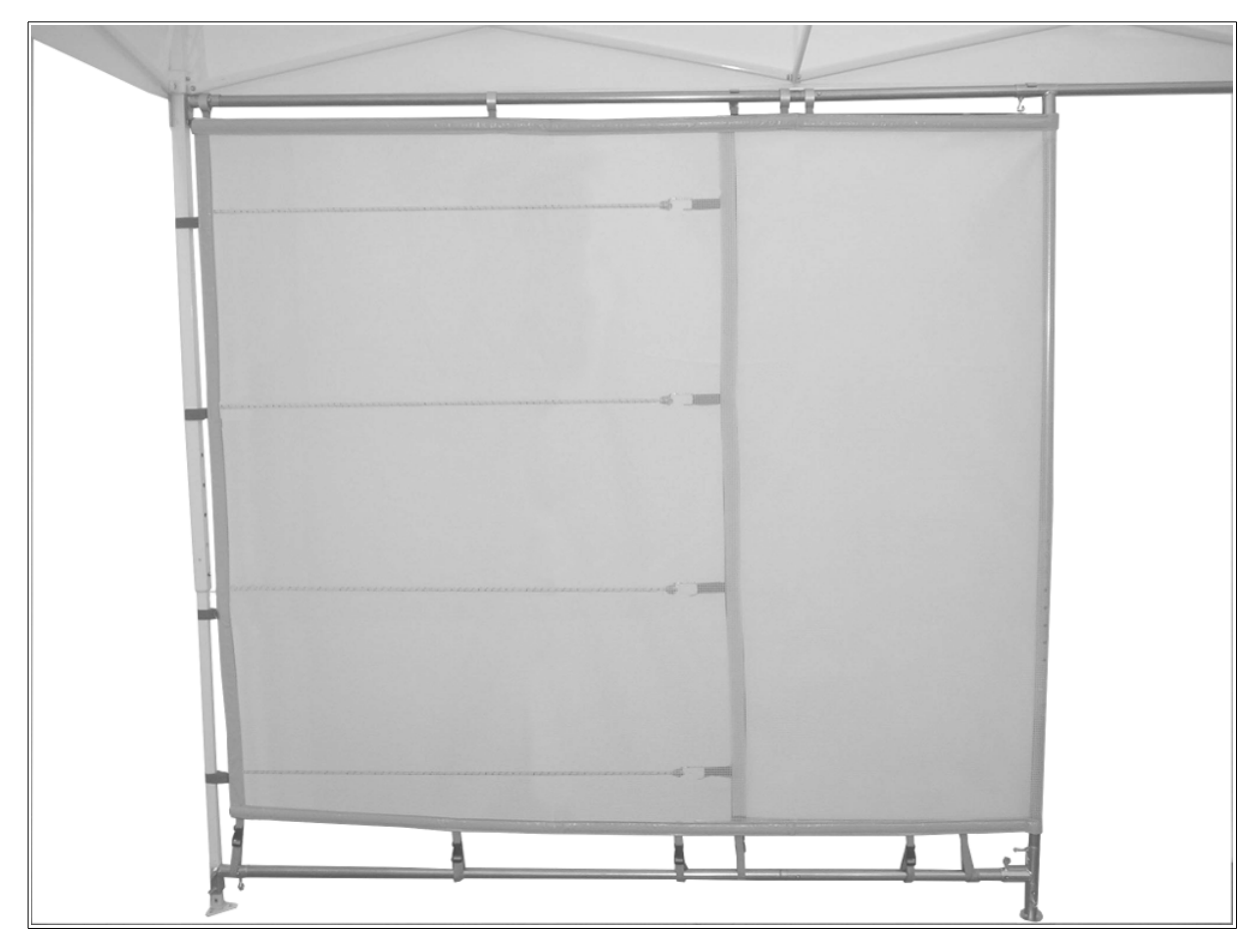
*To return the Convertible MeshPanel to 10' width, carefully push the protruding flat bar sections back into their sleeves.