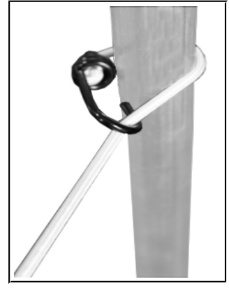
Bungee wrapped and hooked around corner leg