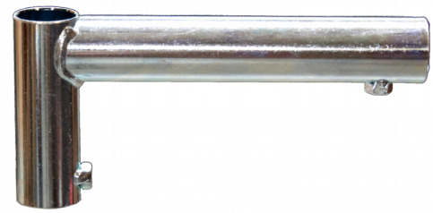
Long Ell Joint